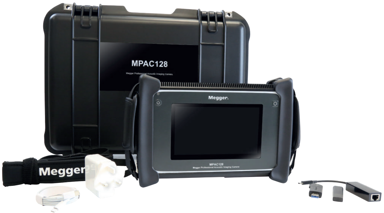
MPAC128 with carry case and accessories; carry strap, power plug and cable, Ethernet to USB-C adapter, 32GB USB memory stick, USB adapter for SD card and micro SD cards.